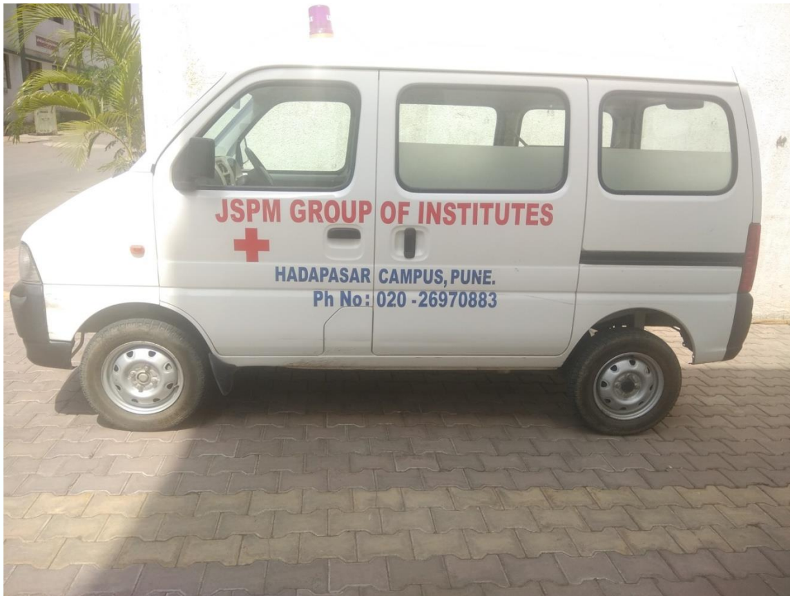
Ambulance for Medical Emergency in campus.

The institute JSPM'S JSIMR is well equipped with Ambulance with is operational 24x7 in the campus in case of any emergency. The institute has also tied up with leading hospital for regular checkup of the students and faculty members. Blood donation camps are also held at regular interval.